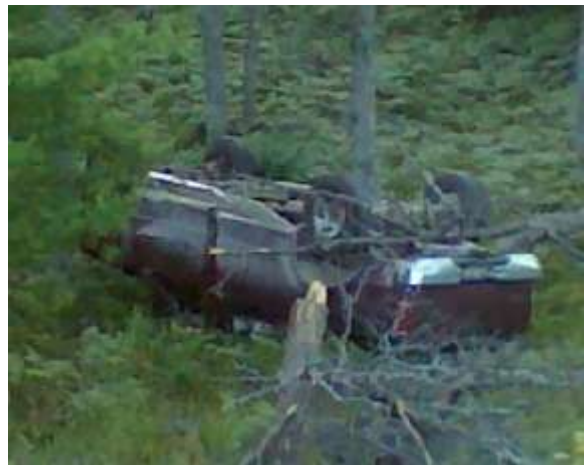
Truck Bear Accident, 6 miles South of M-32 on M-65 9-4-09